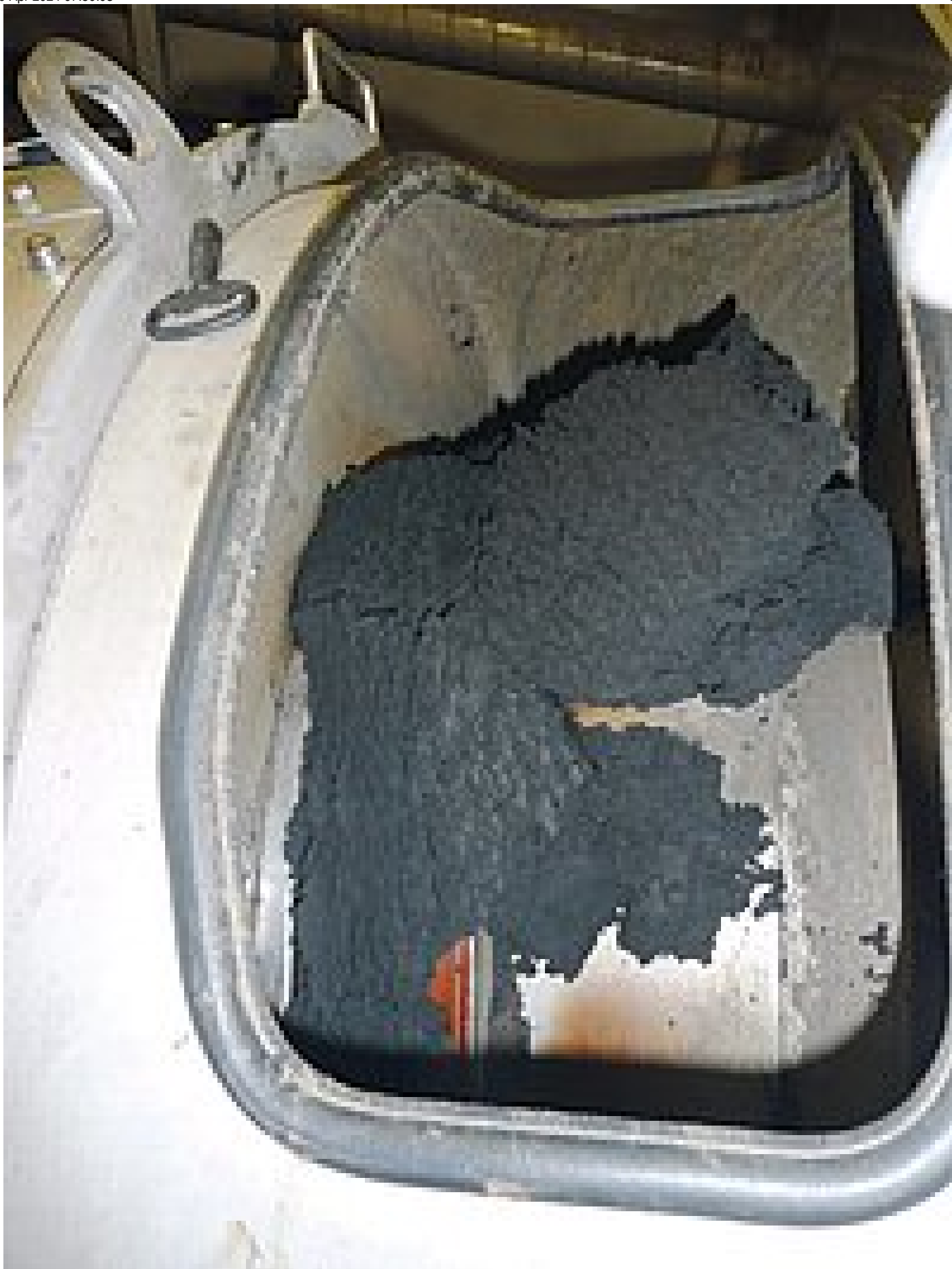
Dewatered sewage sludge from the RoS 3Q 620 screw press

It remains to be seen in how far maintenance costs will decrease in Hämeenlinna which were the decisive factor for the customer to buy the HUBER product. On the basis of the experience we have made over many years with our ROTAMAT® Screw Press RoS 3Q units, however, we expect savings of 70 to 80% compared to the centrifuges.