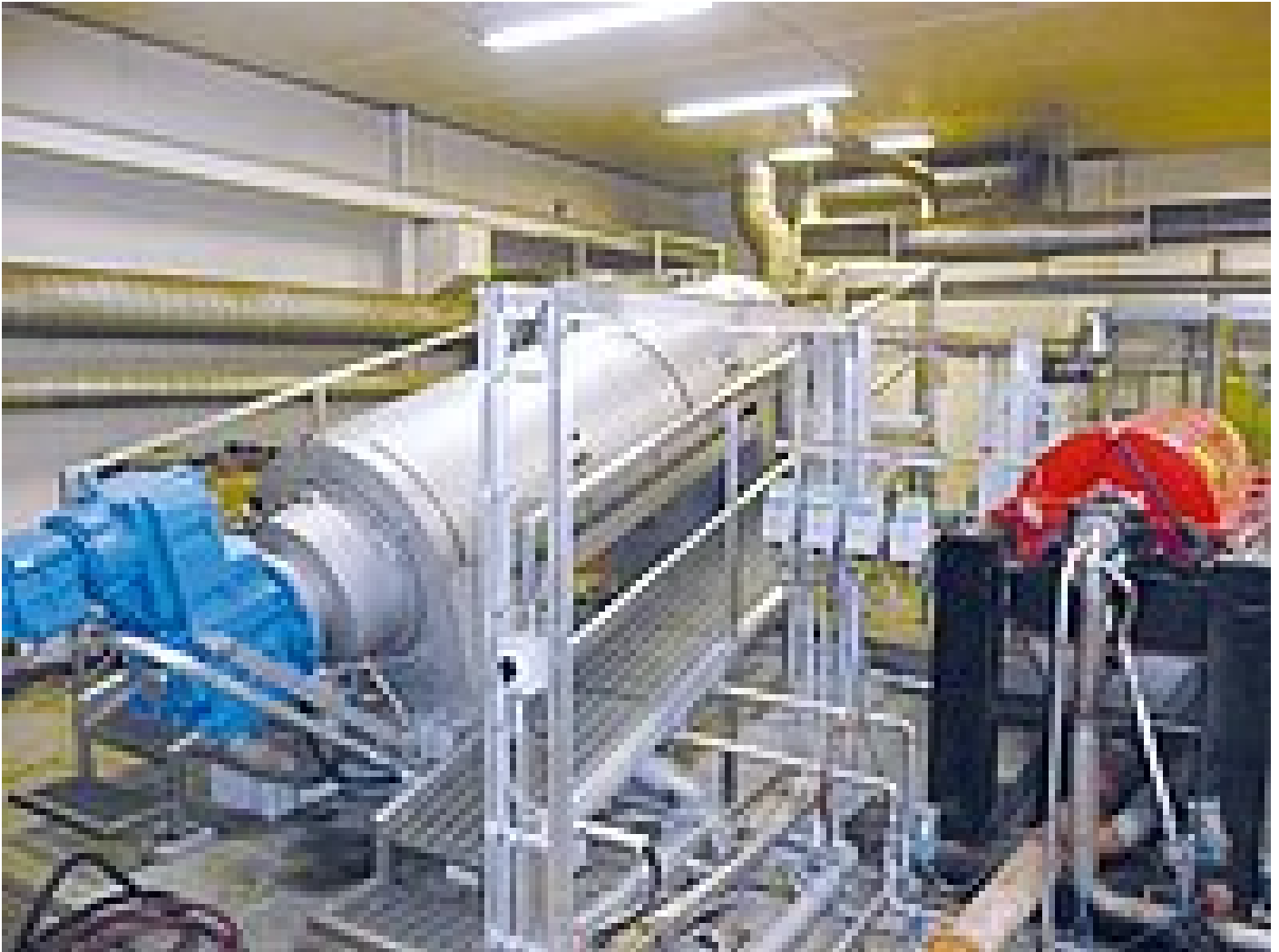
Screw Press RoS 3Q 620 beside the maintenance-prone decanter

Cost-efficient, low wear: HUBER ROTAMAT® Screw Press RoS 3Q in Finland