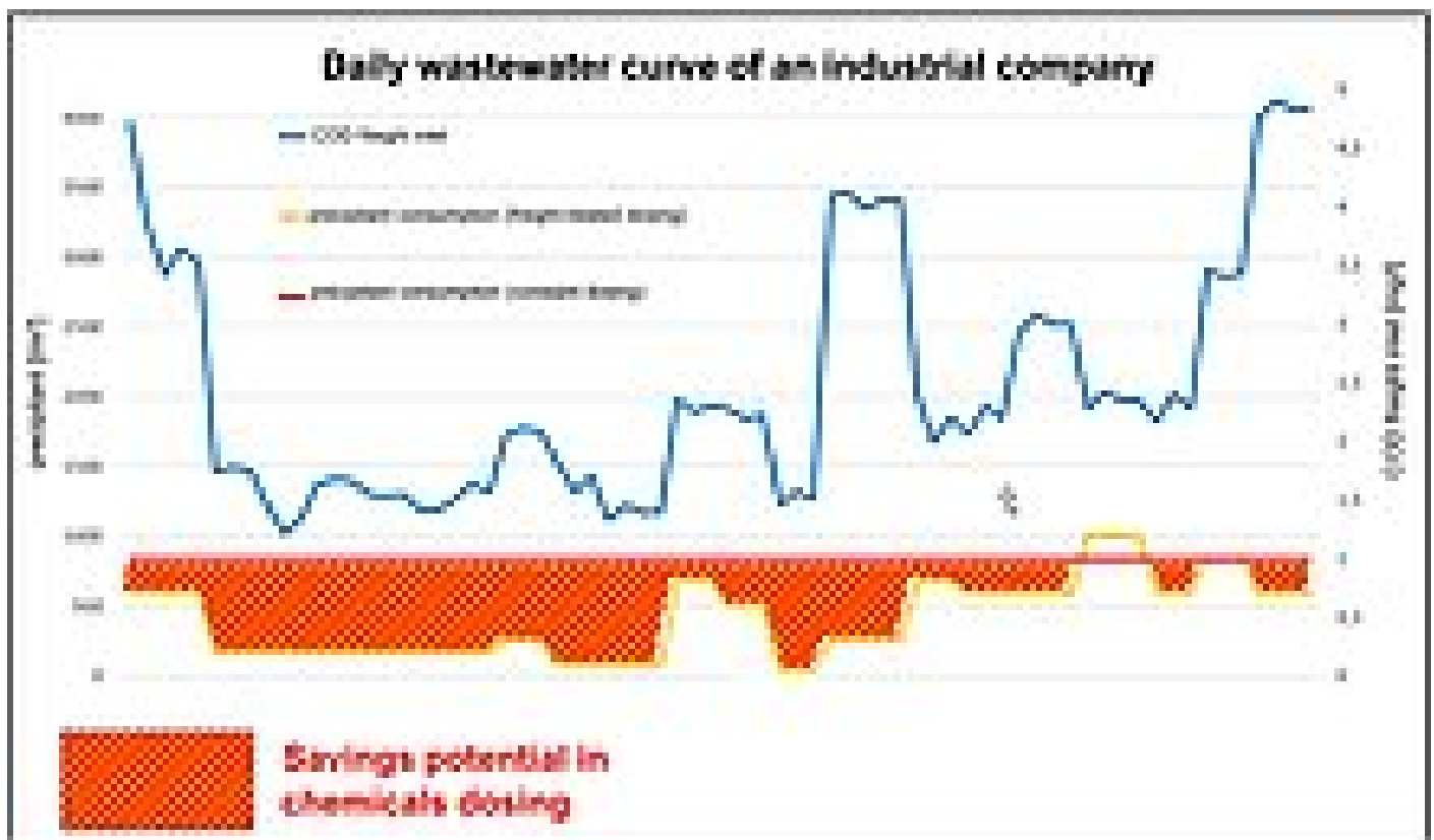
Fig.1 : Variation of pollutant loads over the day and possible savings with the use of the HUBER DIGIT-DOSE system

In practice, it is however difficult, not to say almost impossible, to dose the precipitants and flocculants optimally.