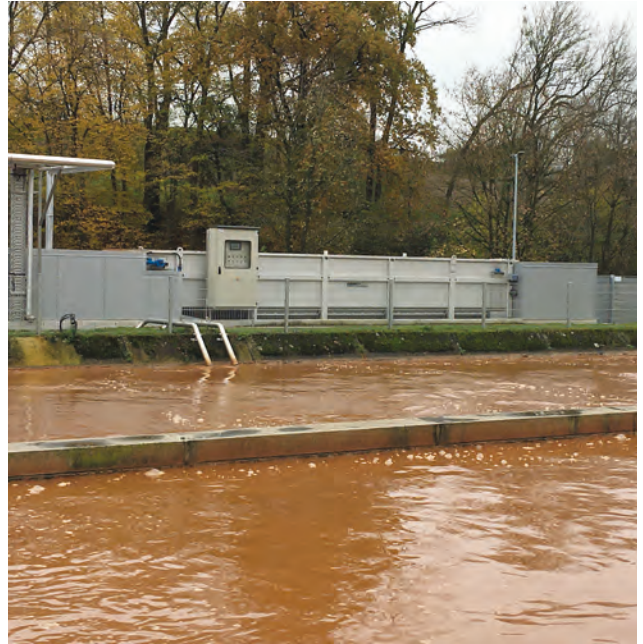
HUBER Dissolved Air Flotation systems for sludge separation and effluent treatment – the solution for upgrading overloaded wastewater treatment plants.