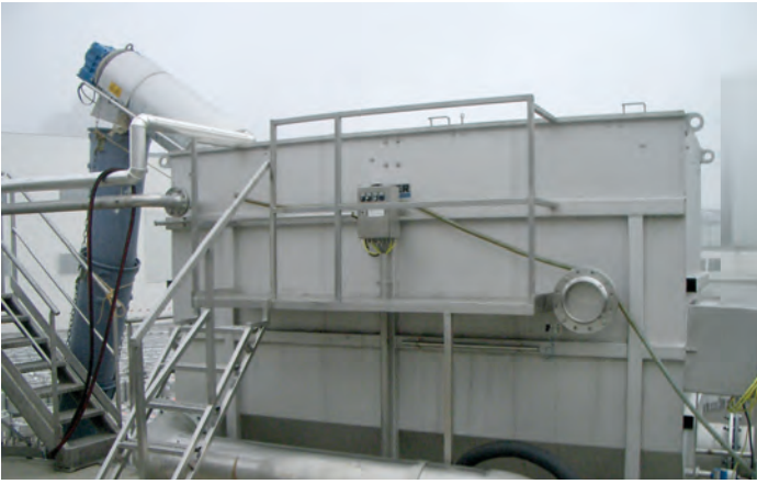
HUBER screening systems for mechanical pre-treatment – efficient, durable and well proven.