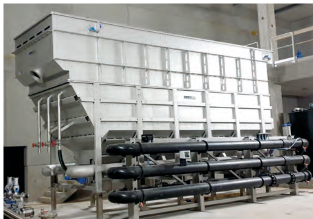
HUBER Dissolved Air Flotation for physical-chemical pre-treatment – optimum reduction of COD, fats and solids, more than 500 installations worldwide.