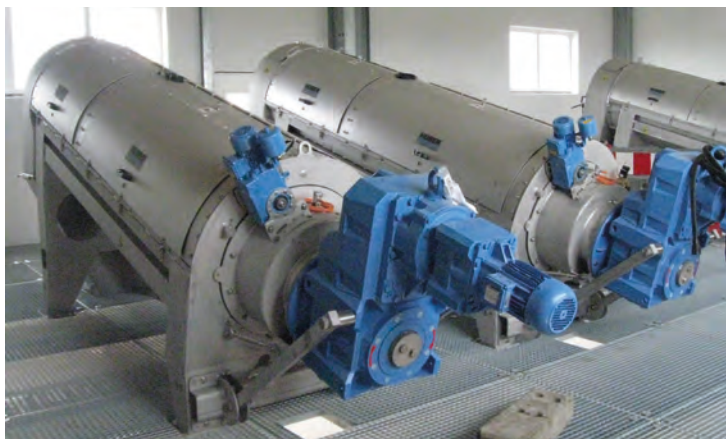
g performance and highest volume reduction for lower disposal