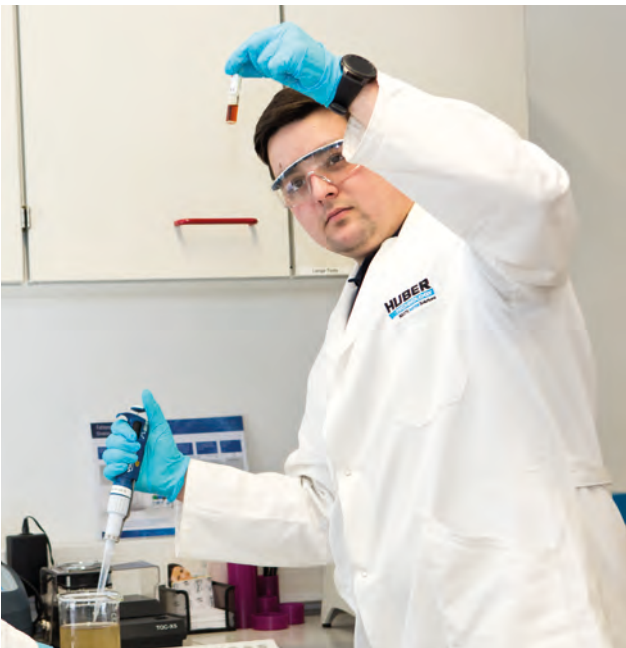
Preliminary tests in the laboratory or on site to determine operating parameters and effluent values – safety for customers and operators.