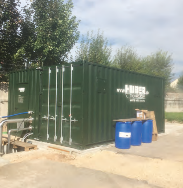
HUBER plant technology in container design – flotation or sludge dewatering units without construction work – ready for immediate use.