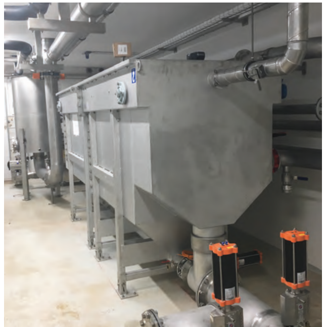
HUBER Heat Exchanger RoWin for heat recovery and wastewater cooling – energy optimisation and compliance with temperature limits.