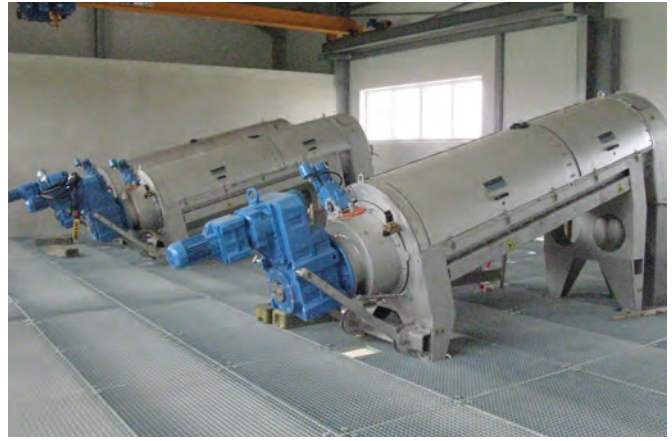
HUBER Screw Press units for sludge treatment – best dewatering costs.