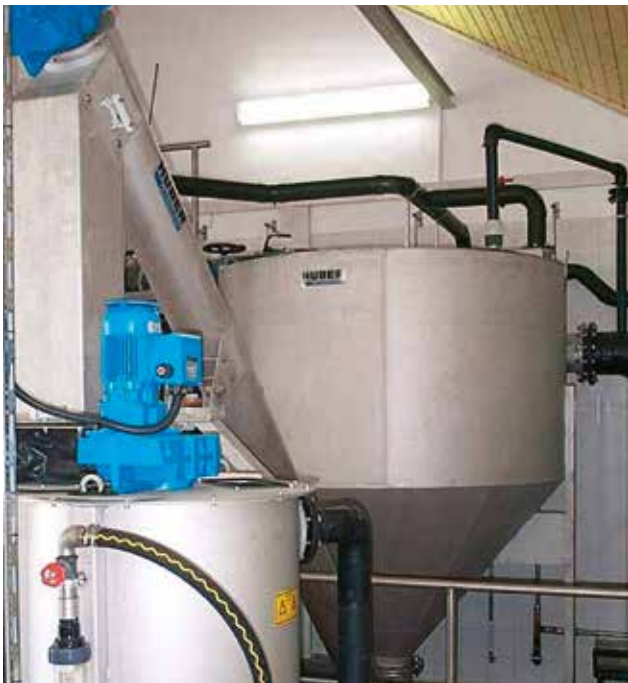
HUBER Circular Grit Trap HRSF with integrated classifying screw and subsequent HUBER Grit Washer RoSF4 T.

The layout of the HUBER Circular Grit Trap HRSF was made on the basis of numeric design engineering and tested and verified under practical conditions in collaboration with the German test institute LGA.