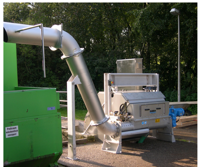
Reliable screenings treatment with the HUBER Screenings Wash Press WAP®.