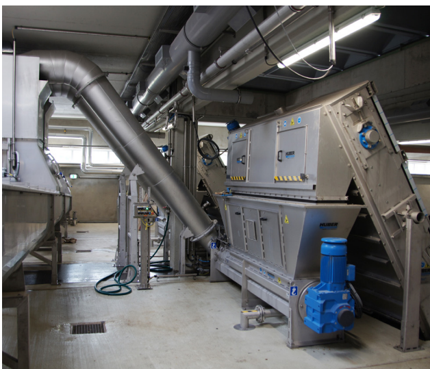
Typical application – direct feeding of a HUBER Screenings Wash Press WAP® from screens.

For an optimised maintenance strategy, machine sizes 2-12 are equipped with wear detection of the compacting screw in the press zone. The system automatically detects the ideal time for maintenance of the auger.