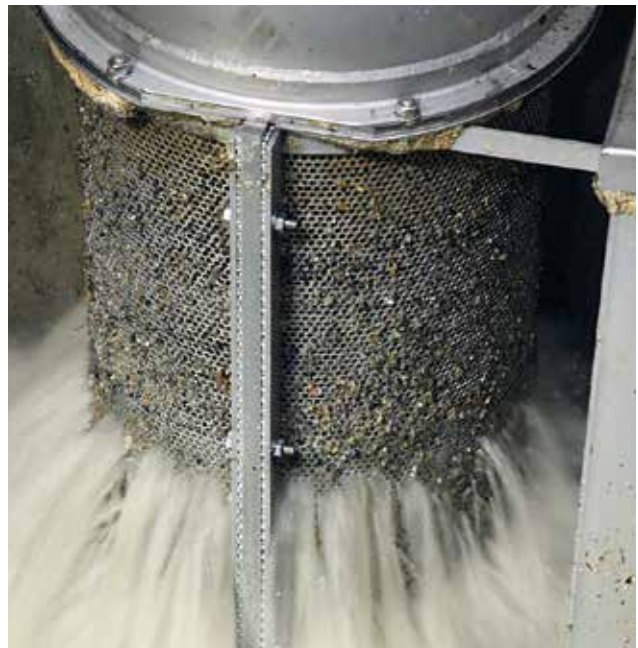
HUBER Pumping Stations Screen ROTAMAT® RoK4 in operation.