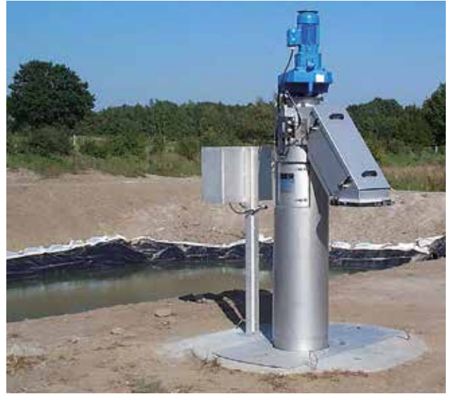
Installation upstream of a pond plant.