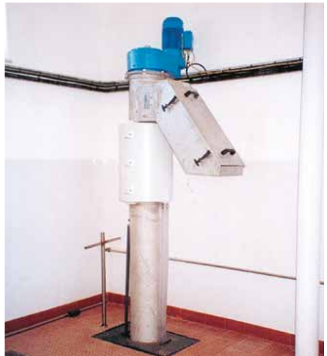
Indoor installation on a small footprint.