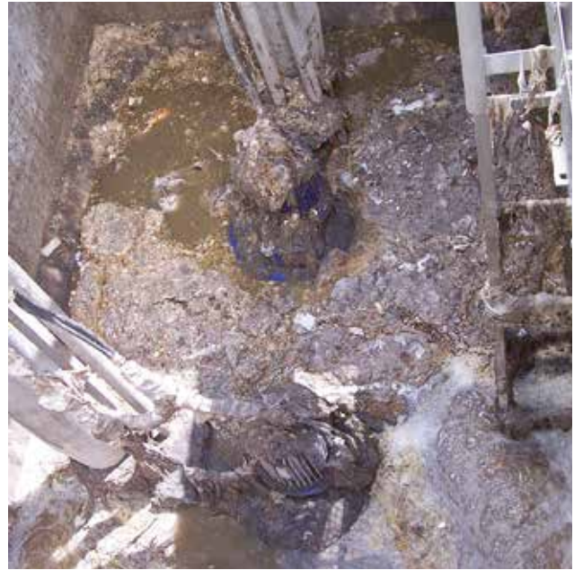
Clogged pumps caused by the solids within the medium to be delivered.

The screen consists of a vertical perforated screen basket and a shafted auger in a vertical tube. The wastewater flows through an inflow connection and a chamber into the screen basket. Within the screen basket the flights of the screw are equipped with wear-resistant brushes for effective cleaning of the screen. As the screenings are gradually elevated by the auger, they are dewatered. The compacted screenings are discharged into a container or endless bagger thus eliminating odour nuisance. The screened wastewater flows off by gravity or is pumped to a higher level. The filtrate drains through a hose back into the inlet chamber. The top of the inflow chamber is open and serves as an emergency bypass so that the machine can be submerged without problems, e.g. in case of a power failure. The integrated bottom step prevents back-flooding into the sewer system and thus undesired deposits in the incoming sewer.