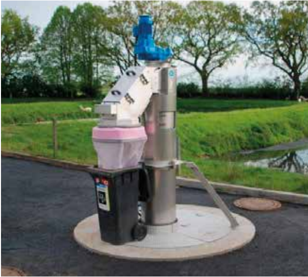
Frost protected outdoor installation.

A selection of installation examples will convince you of the HUBER Pumping Stations Screen ROTAMAT® RoK4.