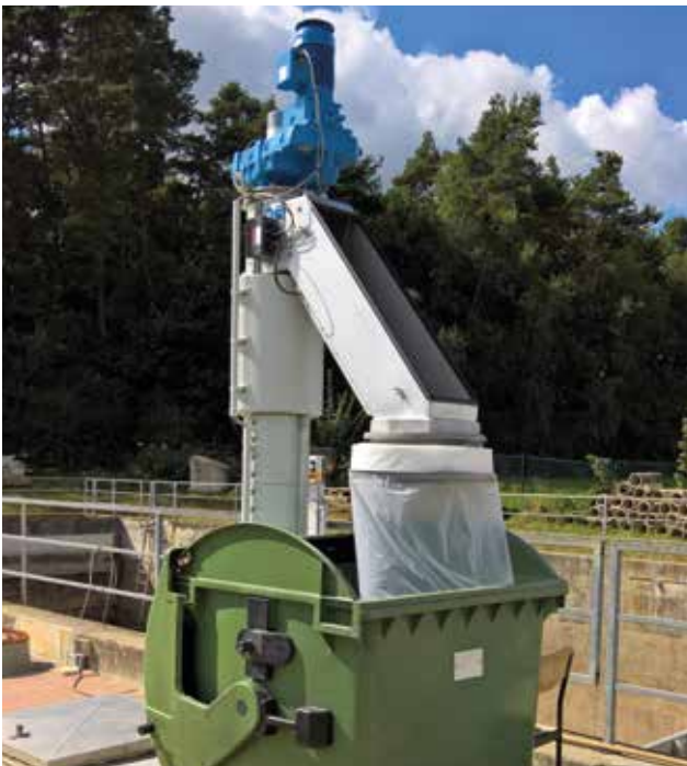
Screenings discharge into a bagger for odour-free disposal.