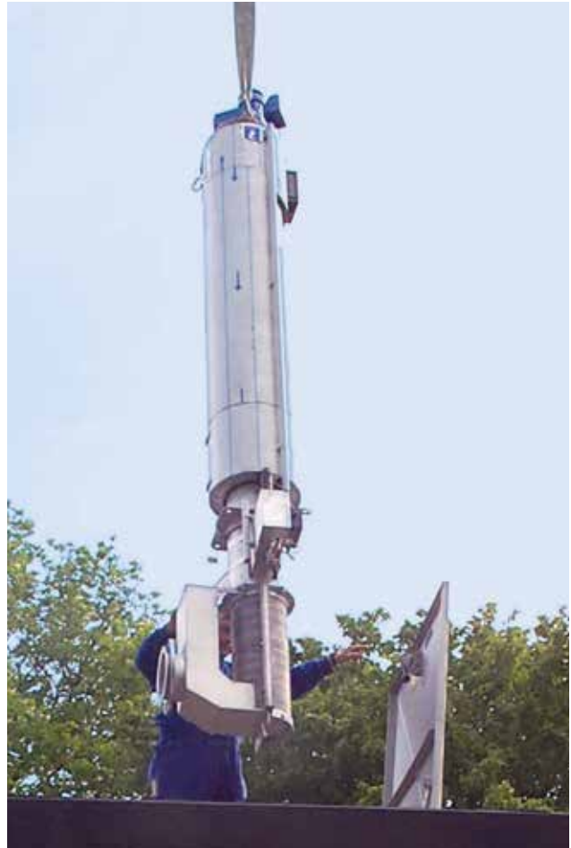
HUBER Pumping Stations Screen ROTAMAT® RoK4 being lifted into a pumping station.