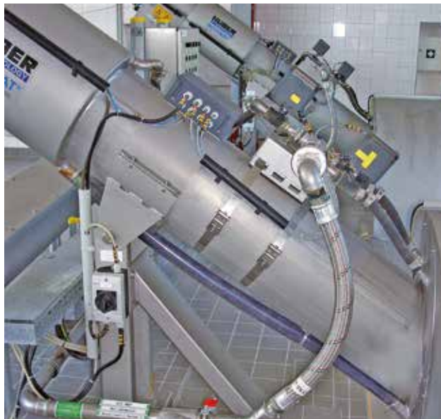
HUBER Fine Screen ROTAMAT® Ro1 with integrated Screenings Washing System IRGA installed in the channel.