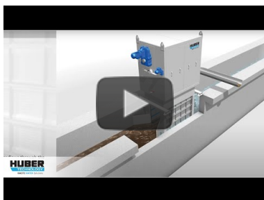
Animation: HUBER Band Screen CenterMax® pp

https://www.youtube.com/watch?v=NXErUdOr39A