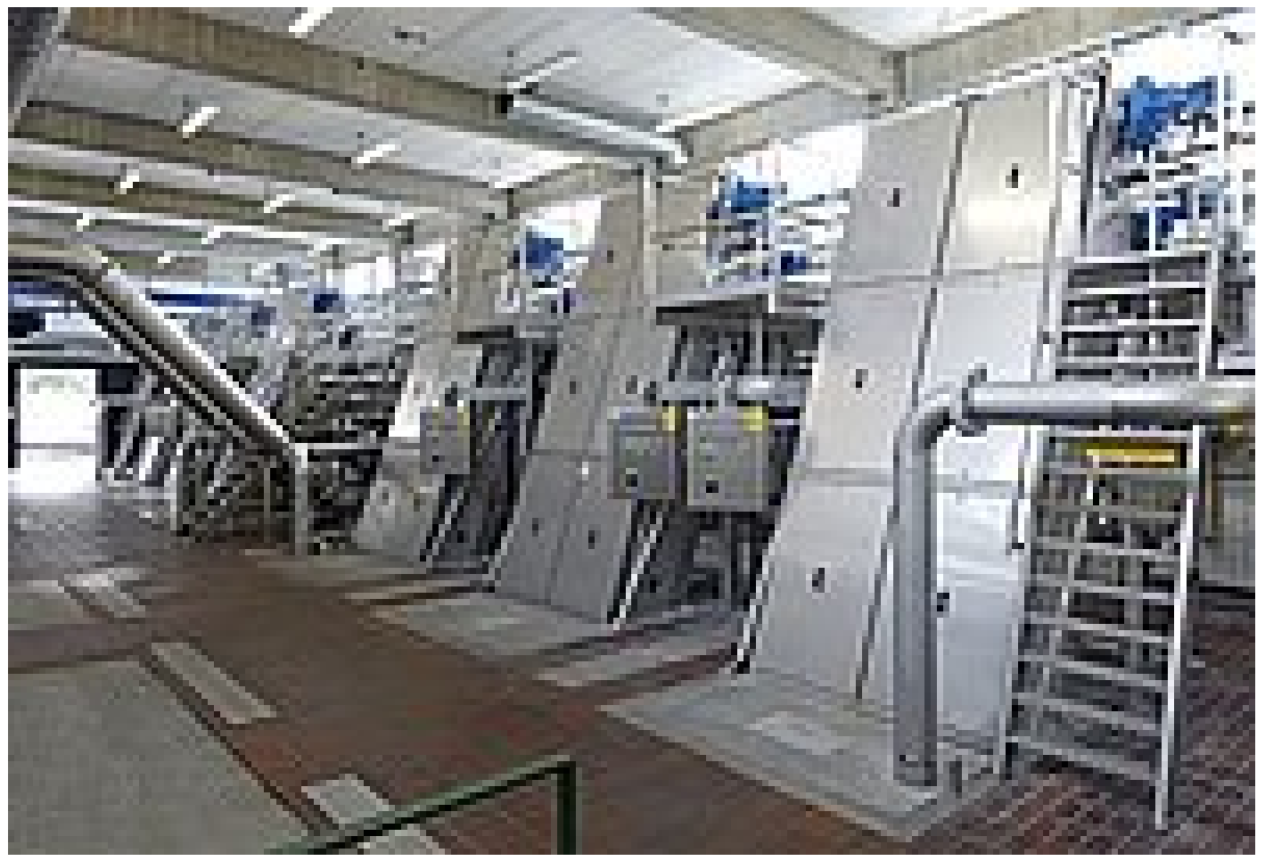
The basis for our EscaMax® success: convincing functionality, consequent further development, and high manufacturing quality

Excellent 84% separation results due to the consequent further development of the EscaMax® Belt Screen